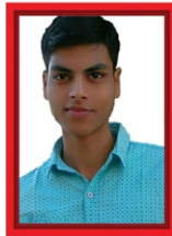
BABLU MEHTO SHIVAAY QUICKBUILD INDIA PVT LTD